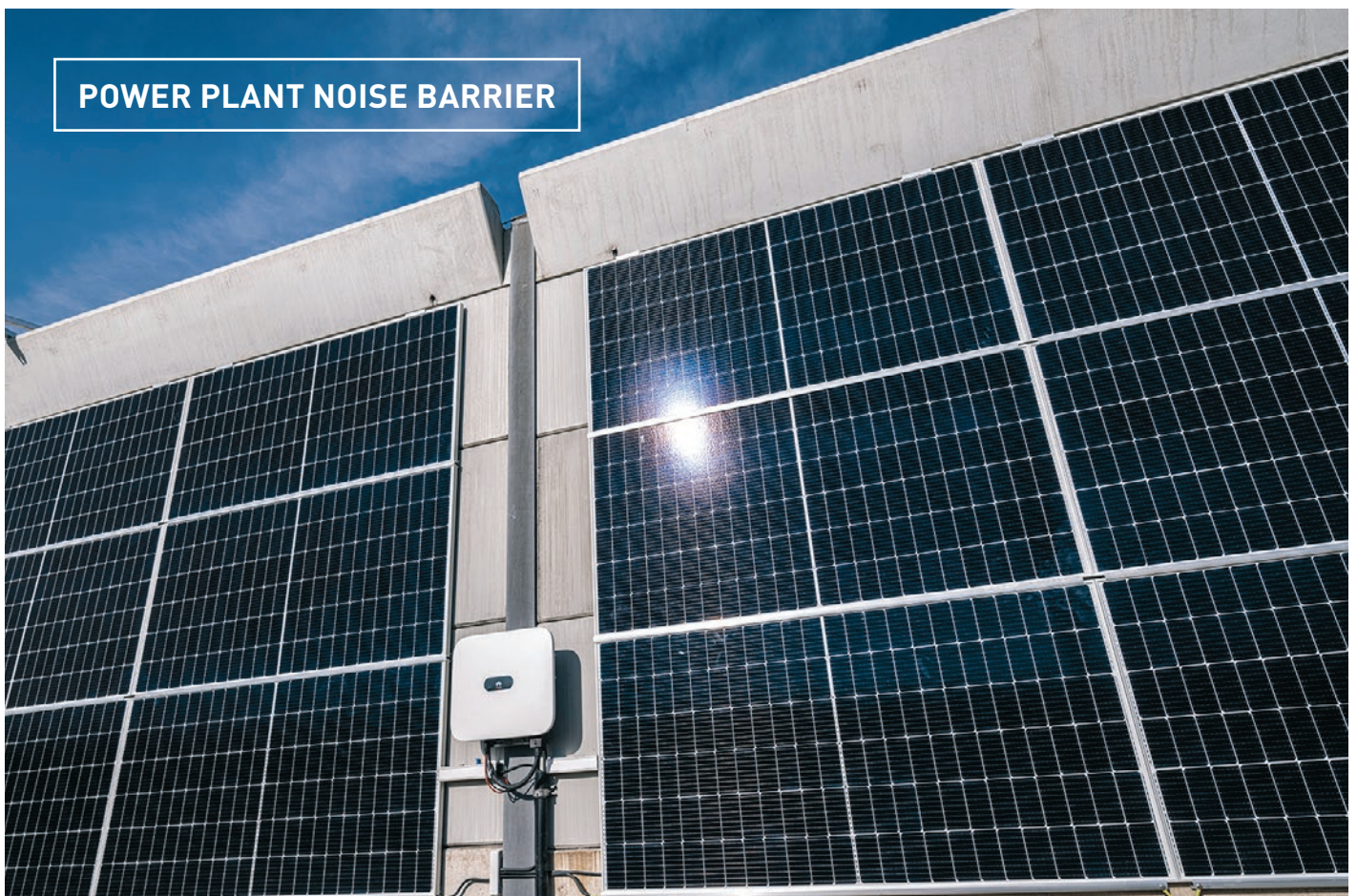
POWER PLANT NOISE BARRIER

But the measures that have now been defined as part of KCS infrastructure positioning go a significant step further, as Gerald Lanz explains: "In the coordination and harmonisation of the considerable internal knowledge pool, we also want to integrate all other corporate activities from purchasing to quality assurance to human resources in future." With this comprehensive strategy, KCS demonstrates the enormous potential of precast concrete elements for the construction of sustainable infrastructure in Austria.