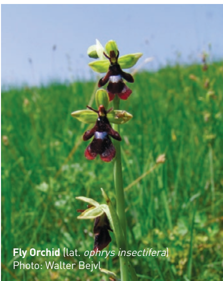
Fly Orchid (lat. ophrys insectifera )

At a certain stage of self-renaturation, the curtain suddenly went up in the old quarry and the rarest orchids appeared on stage at this natural event. Specifically, in 1985 when the fly orchid (popularly known in the region as "Bergmandl" – mountain boy) was first identified. Over the following years, the population literally exploded, with magnificent specimens reaching up to 25 centimetres in height. Seven years later these orchids had disappeared again; they were displaced by the long-leaved helleborine (also a member of the orchid family): Nature takes its time, but never stands still. In truth, an ecosystem