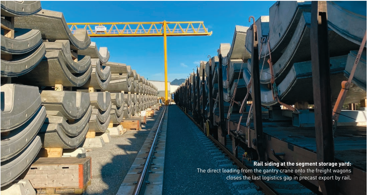
Rail siding at the segment storage yard: The direct loading from the gantry crane onto the freight wagons closes the last logistics gap in precast export by rail.