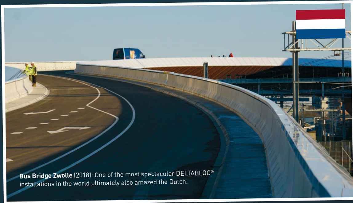
Bus Bridge Zwolle (2018): One of the most spectacular DELTABLOC® installations in the world ultimately also amazed the Dutch.