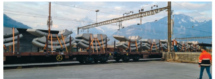
Photo on the left: Track work for the railway siding at Katzenberger Fertigteilindustrie. Right: Arrival of the loaded train in Switzerland.

The call for CO 2 -saving solutions is louder and louder. Especially in the so-called DACH region (Germany, Austria, Switzerland), institutional framework conditions are being created that mean we can expect a shift of transports away from road to rail. And for this reason, transport by rail is the obvious choice for heavy and highly specialised precast concrete parts. But the optimal logistics solution begins when the concrete parts leave the production hall.