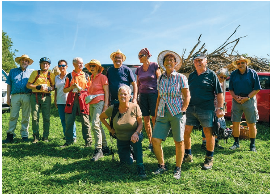
On the meagre lime meadows around the quarries the Bergma(n)dl Conservationists in Micheldorf are not only responsible for flowering diversity, but also for good humour!

is nothing more than a constant struggle for the available resources, unless somebody devotes a great deal of care and attention to bringing one or the other species back to a fulminant revival.