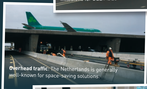
Overhead traffic: The Netherlands is generally well-known for space-saving solutions.