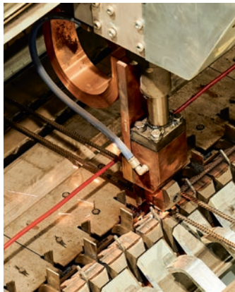
Up to 200 square metres of reinforcement mesh per hour can be welded in variable sizes.