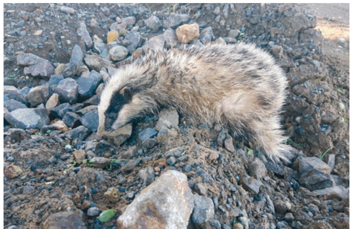
Snakes, lizards, beetles and mammals: the quarry site is full of activity – by day and by night.