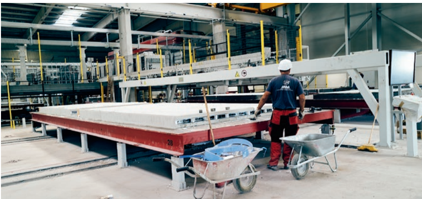
Despite the high degree of automation, there is enough space for manual finishing. Without robots, but with good old-fashioned wheel barrows.