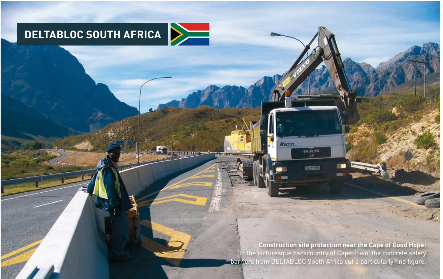
Construction site protection near the Cape of Good Hope: In the picturesque backcountry of Cape Town, the concrete safety barriers from DELTABLOC South Africa cut a particularly fine figure.