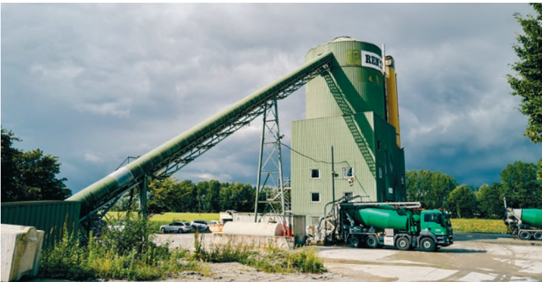
REMS BETON: During the past 38 years since its founding, this regional supplier has already delivered a total of 2.5 million cubic metres of concrete.