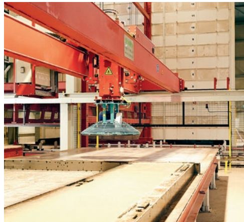
Left: The demoulding and shuttering robot identifies the shutterings with a camera and a laser scanner. Right: Post-processing station and curing chamber.